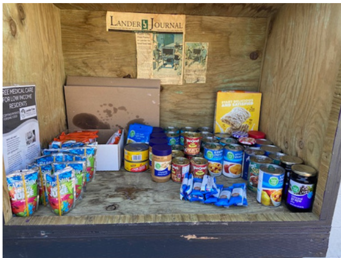
FLC helped stock the Little Free Food Pantry at Snow Deep

Thank you to Lander's Rotary Club for researching and working to come up with a list of suggested food items that are best for the people these pantries are serving. If you are shopping and would like to contribute to the Little Free Food Pantries, please use this list to help!